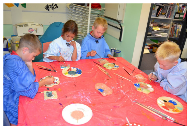
Concentrating in Art!