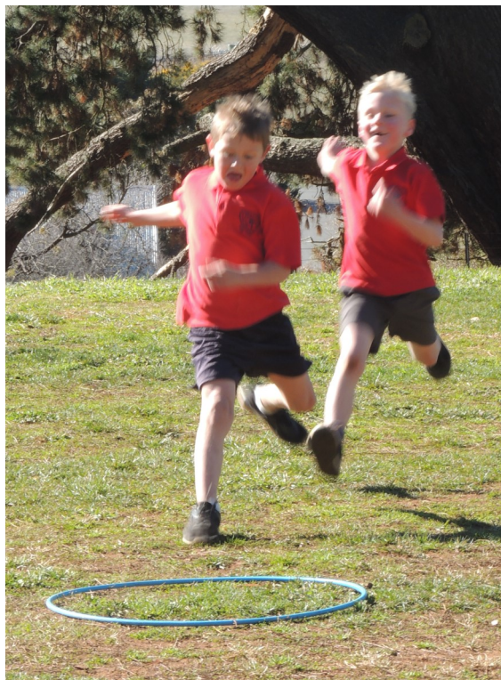
K-1-2 sport—the students love to play this game—you might like to ask them how to play.