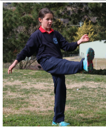
Our kids just loving Rugby— even if the weather was atrocious