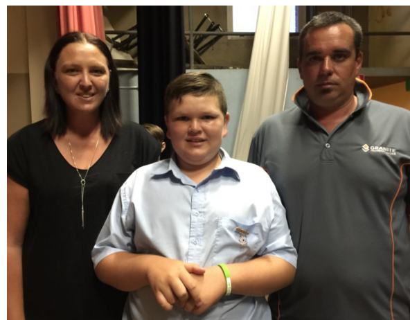
Congratulations boys, we know you will do our school proud!!