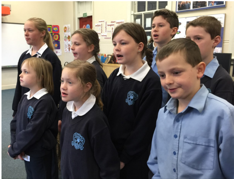
Some of our students practising singing for our production of "The Lion King."

These positive behaviour results relate to the previous week.