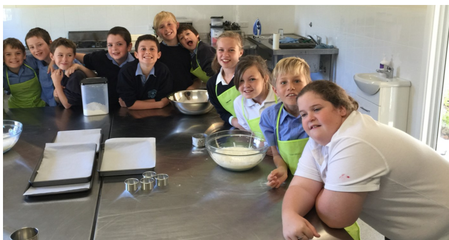
Years 3-4-5-6 enjoyed making scones for the School Fair - love cooking!!!!