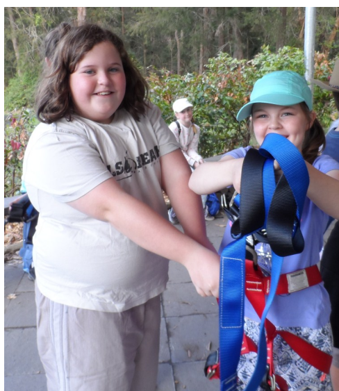
Some more activities enjoyed by our students at camp