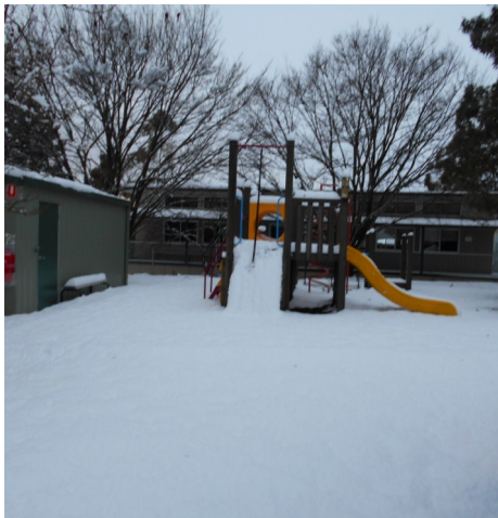
The fall of snow that closed our school on Friday, 17th July, 2015

HAPPY BIRTHDAY..... To those students celebrating their birthday in JULY: