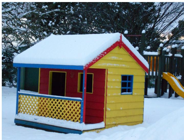
How pretty is the cubby - 17-7-2015 ↑

This is so important when you are away for a week.