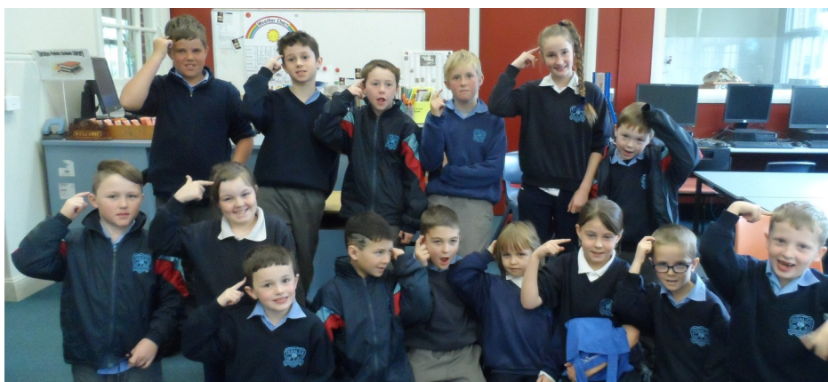
Our students sporting new haircuts ready for an exciting Term 3.