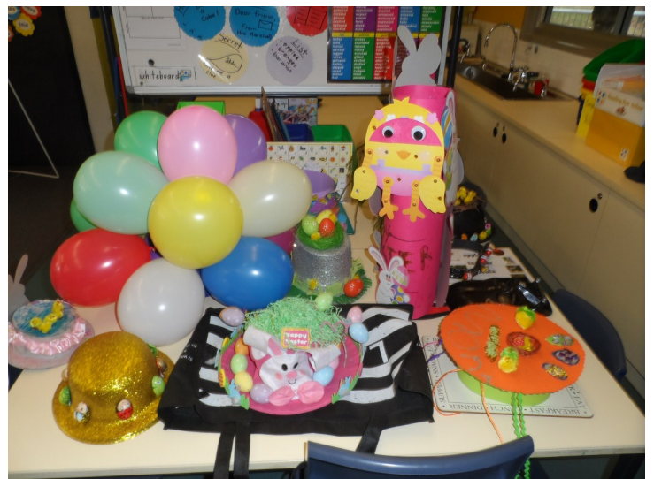
↑ Some of the Easter Hats on show - hope you are lucky in the raffles!!!