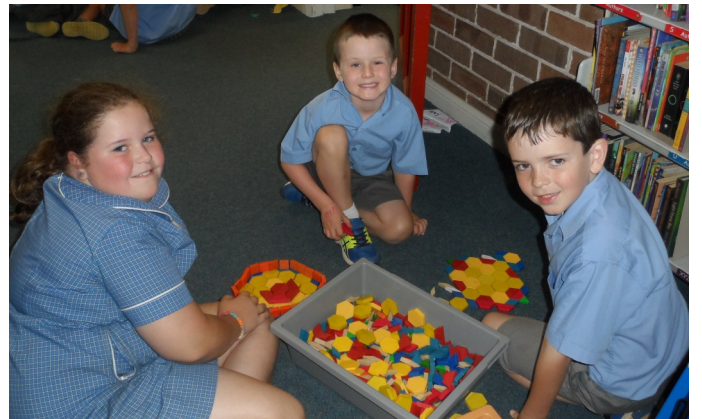
Some of our fantastic students - loads of variety!!!