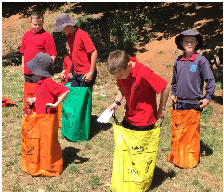
A group of our students participating in tabloid sports - great fun!!