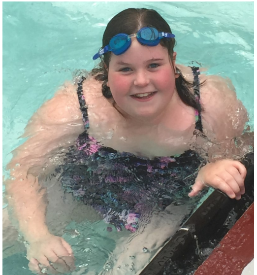
Swimming is over for another year - our students really enjoy this life saving activity!!!