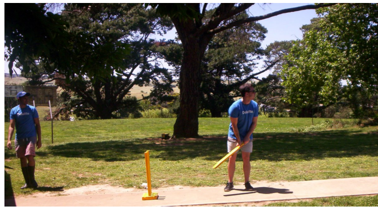
A friendly game of cricket during recess, unwind those muscles!!!