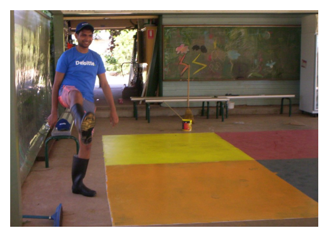
Thank you so very, very much, our school looks fantastic!!!!